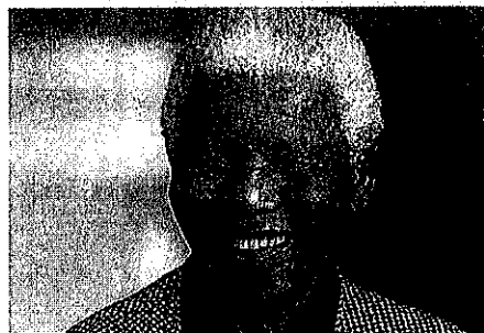
Nelson Mandela (1)