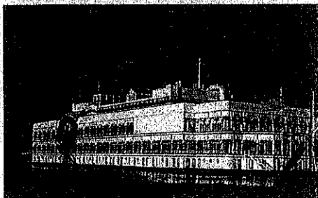
Lakeside Mall (1)